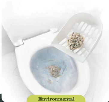
Environmental protection concept