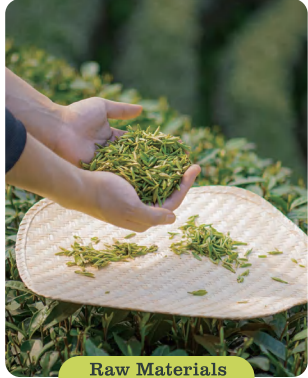
Raw Materials And Processes