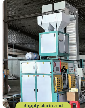
Supply chain and production capacity